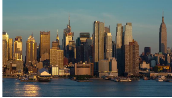
New York Skyline