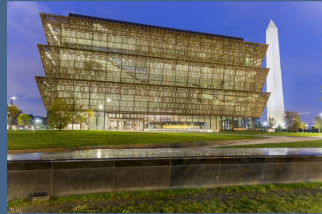
Museum of African American History and Culture

The trip to Washington DC's National Museum of African American History and Culture and the Museum of the Bible is on Thursday, November 8 . Space is still available for this day trip.