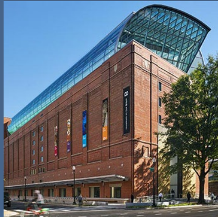
Museum of the Bible